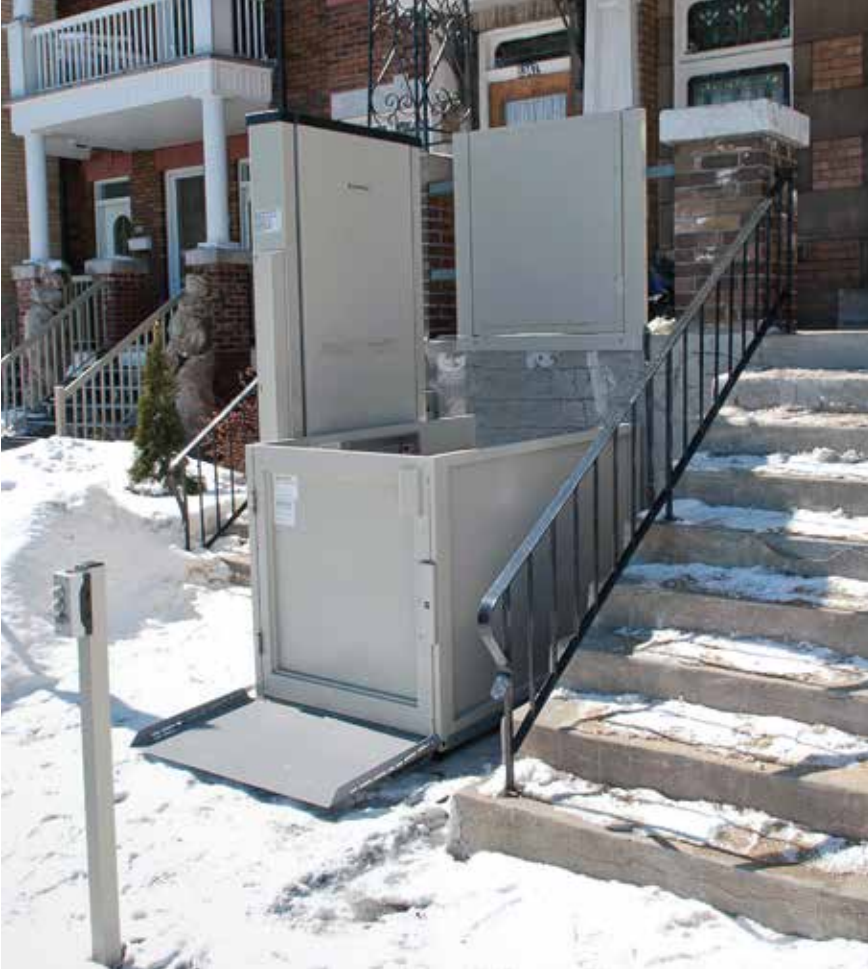
Robust design for installation in any climate