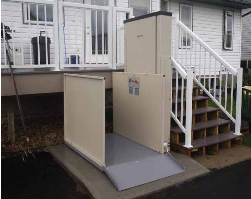
Upper gate integrated into balustrade