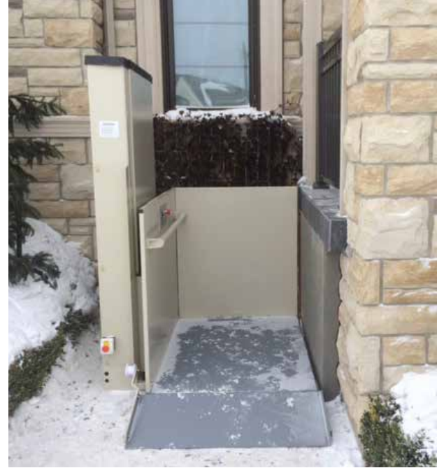
Platform with side exit on upper level