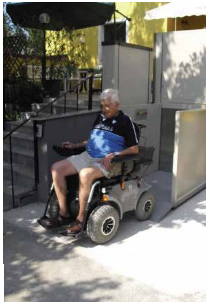
The Elevex vertical platform lift