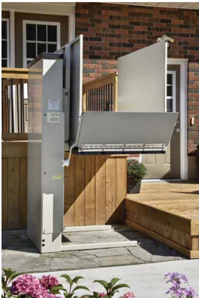
Free standing drive tower for ease of installation