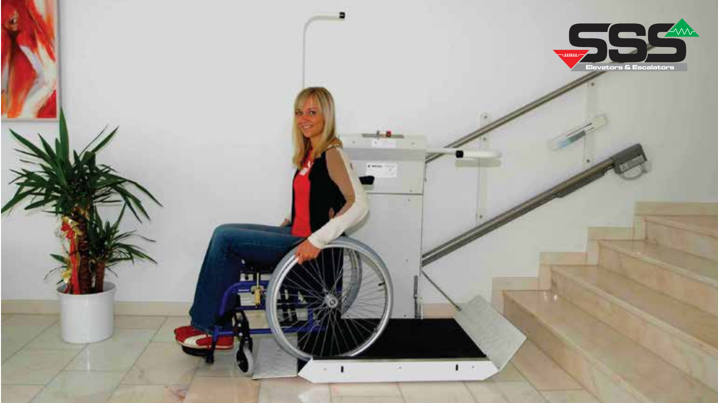
An elegant and modern lift that fits smoothly into any environment